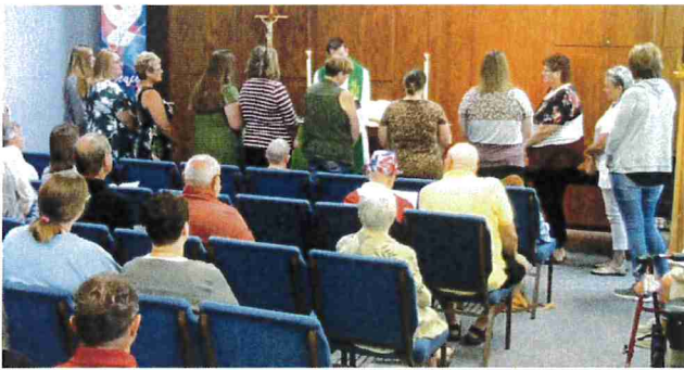
Installation of ZCA staff and Zion Sunday School Teachers, August 13, 2023