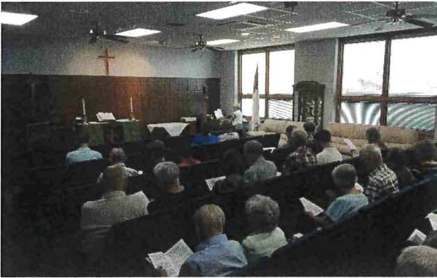
Worship service being held in West Fellowship Room while flooring and lighting projects are being done in the sanctuary.